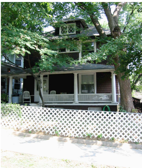
Oxford House-Delafield 1319 Delafield Place, NW Washington, DC 20011 A recovery home for men established July 1988 Men – Tel. 202-723-3726

The lack of more growth in the number of Oxford Houses in the District of Columbia arises from the failure to utilize paid outreach workers to help recovering individuals rent suitable houses and establish Oxford Houses. Consequently, applicants to the existing 14 Oxford Houses in the District of Columbia are turned away every day because all the beds are full. The limited growth of Oxford Houses in DC is ironic because the original houses in DC are the foundation for the entire network of 1100 houses throughout the country.